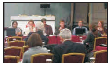
Drynet members during Side Event on "Pastoralism in Dryland Areas"

By Drynet partner: Both ENDS, the Netherlands - drynet@bothends.org