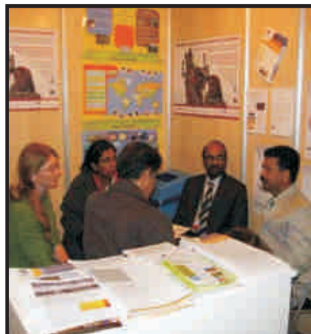
Visit of the Indian Focal Point to the Drynet info stand at the CRIC7.