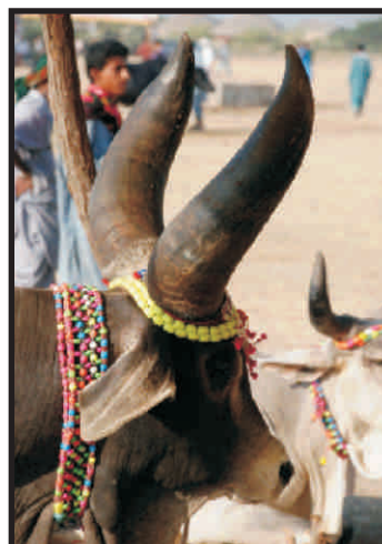
Scenes from the annual fair in 2008. Above: Getting a Banni buffalo ready for the beauty competition.